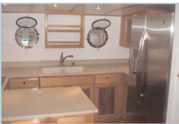
The galley boasts wrap-around corian countertops and home appliances.