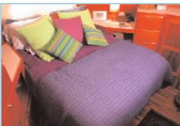
The master features a standard-size queen berth and generous stowage.

Mirage Manufacturing, builder of the Great Harbour Trawlers, has a thirty-six year history of building top-quality boats. Recognized as the largest U.S. manufacturer of full displacement pleasure trawlers, Great Harbour has yet again raised the bar with the new N47. With over two years of design and development in the N47 it still maintains many of the hallmarks of our other models.