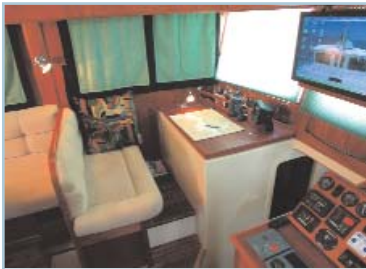
Note the nav table and fold-down computer/television screen.